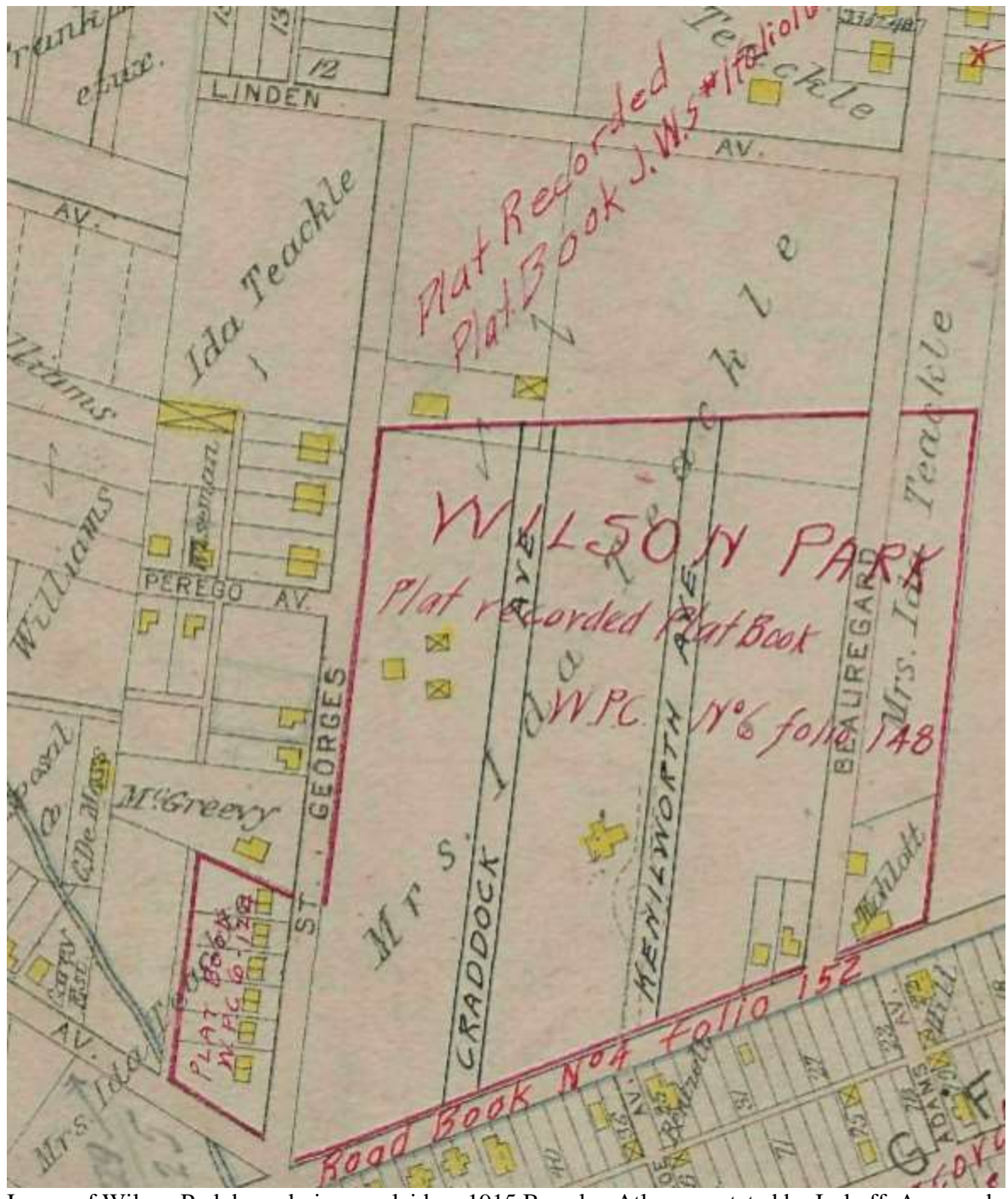
Image of Wilson Park boundaries overlaid on 1915 Bromley Atlas, annotated by Isekoff.