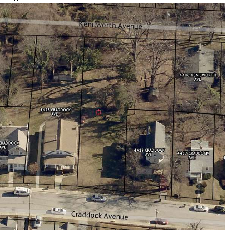
Aerial view from the west.