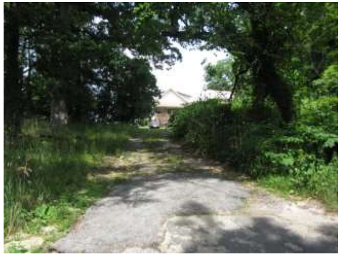
Driveway to rear of house, through wooded backyard.