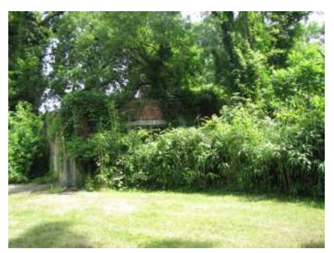
Remains of the garage.