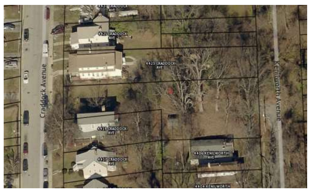
Aerial view from the south.