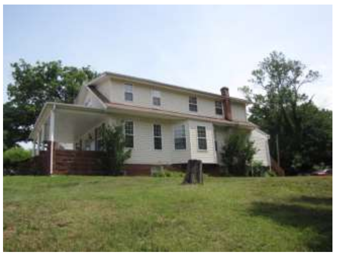
View of side yard and house.